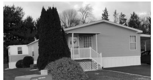
Contest Winner: 212 Jody Drive

We are looking for the best kept home and lot! We are thrilled to have so many homes and lots that are well maintained. To show our appreciation, our inspectors will be looking for those homes each month. The winner will receive a $25 visa gift card and will be announced in the quarterly newsletter.