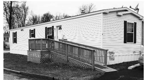
Contest Winner: 5 Rosewood Lane

We are looking for the best kept home and lot! We are thrilled to have so many homes and lots that are well maintained. To show our appreciation, our inspectors will be looking for those homes each month. The winner will receive a $25 visa gift card and will be announced in the quarterly newsletter.