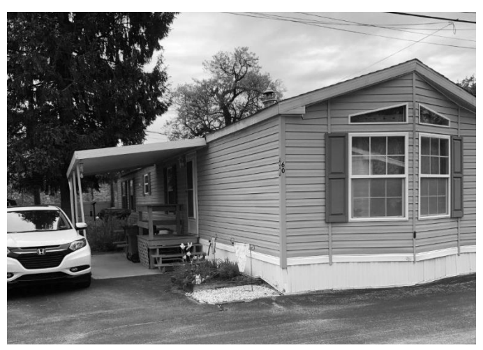
Congratulations and thank you to: 270 W. Uwchlan Avenue Lot #60