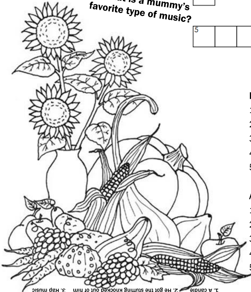
1. A candle 2. He got the stuffing knocked out of him 3. Rap music