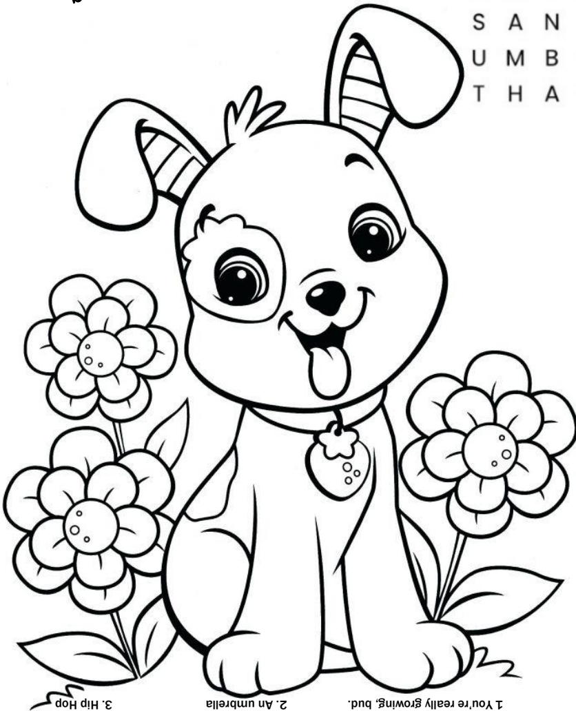
3. Hip Hop