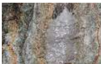
Egg masses (fresh) found October-December

Spotted Lanternflies can lay egg masses on any surface, including trees, plants, outdoor equipment, and vehicles. The egg masses are usually tan/brown in color, often resembling tree bark.