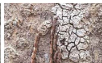
Egg masses (older) found January-June