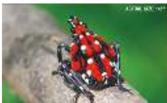
Nymph: late stage found late July-September