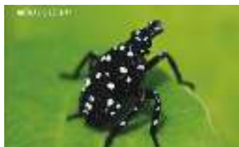
Nymph: early stage found late April-July

Nymphs start appearing in May and go through the stages of development until reaching the adult stage around July. Removing the immature bugs is easier than destroying adults and can prevent damage to plants and trees.